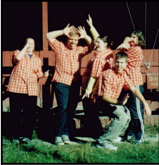
GWUCK at Fall Training Rally

GWUCK President District Secretary-Treasurer-Elect