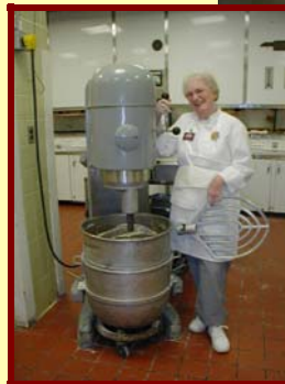
It all starts here in this mixer!

In case you were wondering how much goes into each batch-that's 9 gallons of buttermilk, 20-lb blocks of all-vegetable shortening and 100-lb bags of Southern Biscuit flour. But of course Team Dietrick knows all about the large volumes of product it takes to feed our guests!!!